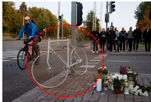
Onnettomuudessa kuolleen miehen ystävät kokoontuivat lauantaina illansuussa turmapaikalle laulamaan laulun. Mukanaan he toivat valkoiseksi maalatun pyörän ja kynttilöitä.

Surmansa saaneen miehen ystävät toivat onnettomuuspaikalle valkoisen polkupyörän.